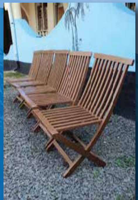
2020 updated version, being sold locally