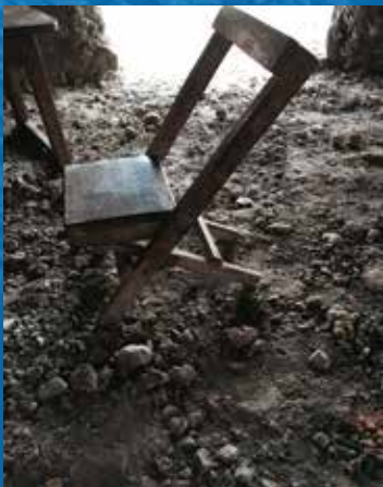
Traditional boma folding chair

In 2020, our Carpenters were able to use the internet to research alternative designs that are proving popular locally - folding wooden chairs to last a lifetime and represent the pride of a job well done!