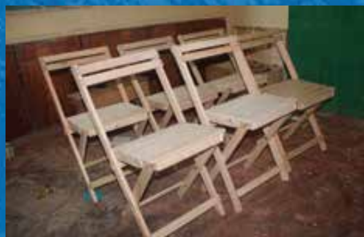
First version developed by Kiwimbi carpenters